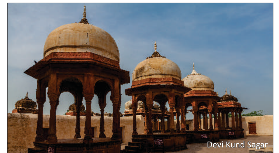
Devi Kund Sagar