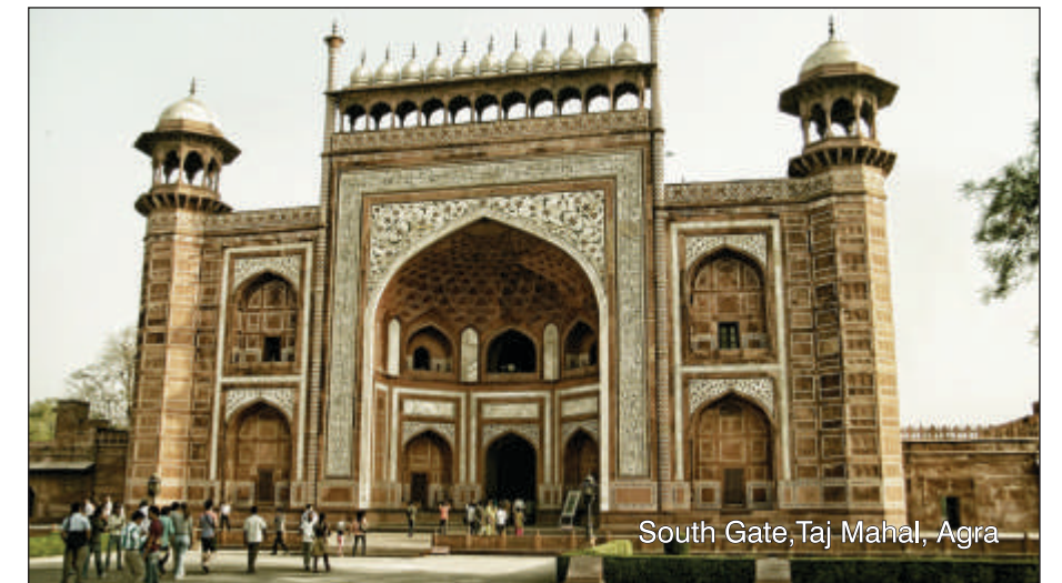
South Gate, Taj Mahal, Agra