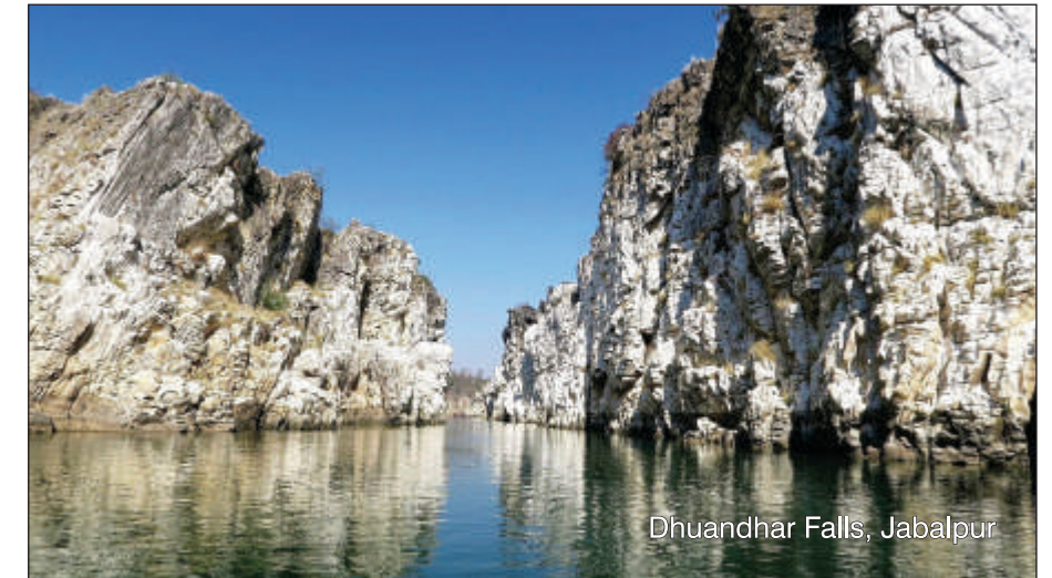
Dhuandhar Falls, Jabalpur

The popularity of Madhya Pradesh as a film shooting destination has certainly grown in the recent times. 'Revolver Rani' (2013), 'Mohenjo Daro' (2016), 'Badrinath Ki Dulhania' (2017), 'Pad Man' (2018), 'Stree' (2018), 'Sui Dhaga' (2018), all films of diverse genres, themes and audiences have found their home in the heart of India.