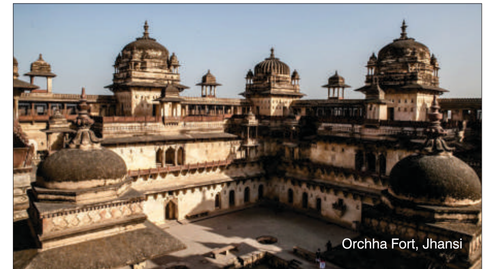
Orchha Fort, Jhansi