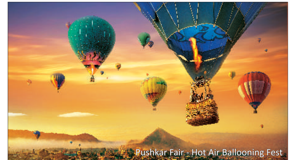
Pushkar Fair - Hot Air Ballooning Fest