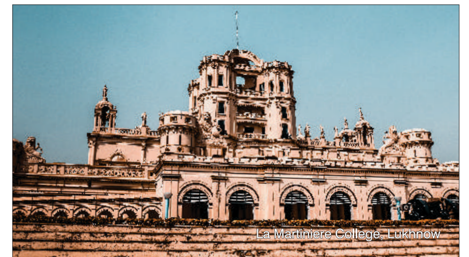
La Martiniere College, Lucknow