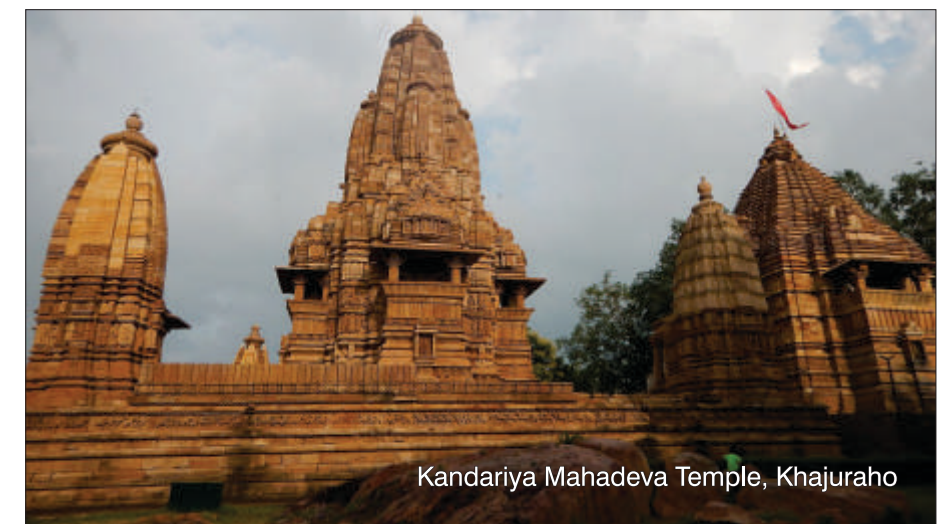
Kandariya Mahadeva Temple, Khajuraho