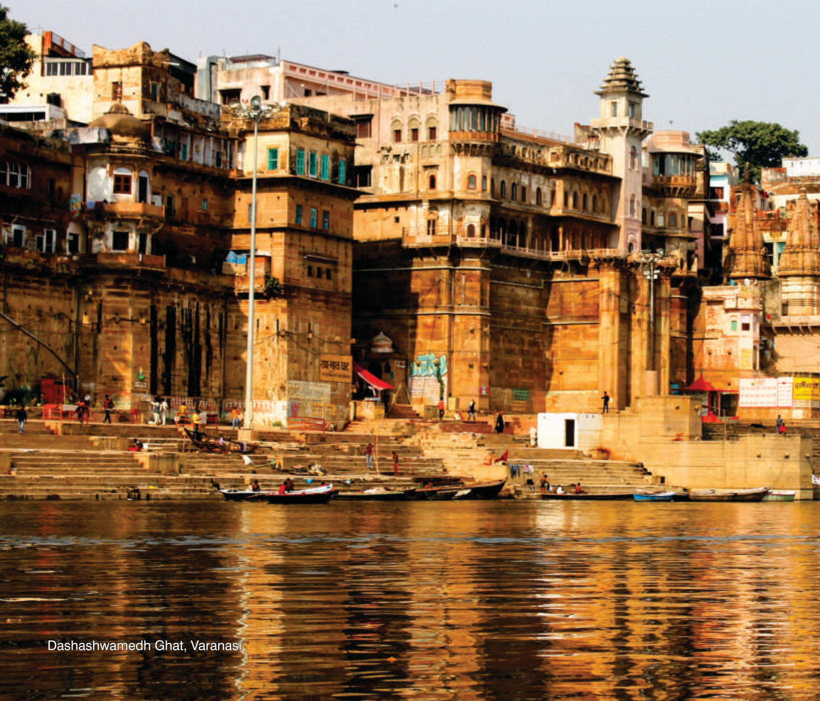
Dashashwamedh Ghat, Varanasi